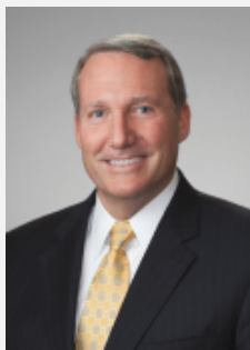
Position: Chairman Director Since: 2008 Age: 56 Independent: No