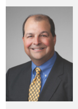
Age: 50 Director Since: 2010 Independent: Yes Committee Member: Audit, Compensation