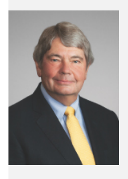
Age: 66 Director Since: 2009 Independent: Yes Committee Member: Audit, Governance