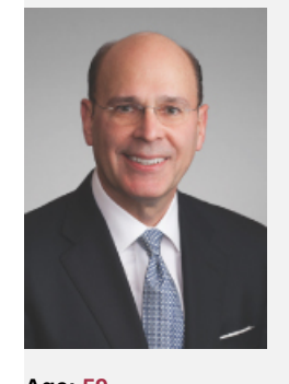
Age: 59 Director Since: 2008 Independent: Yes Committee Member: Audit (Chair), Governance