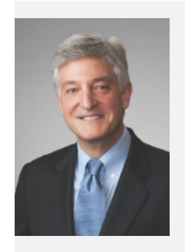
Age: 57 Director Since: 2006 Independent: Yes