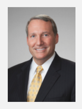
Position: President and CEC Director Since: 2008 Age: 57